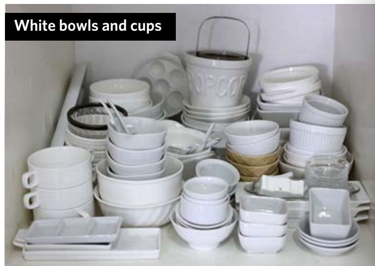
White bowls and cups