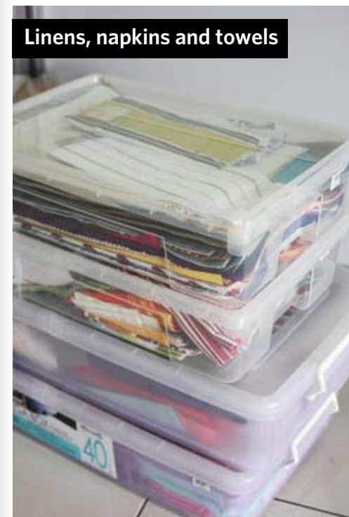
Linens, napkins and towels