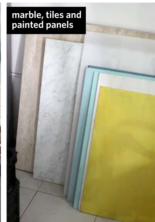
marble, tiles and painted panels