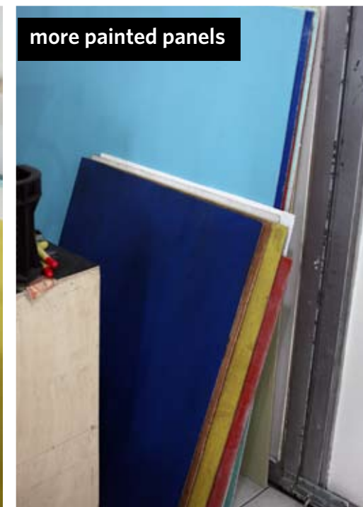
more painted panels