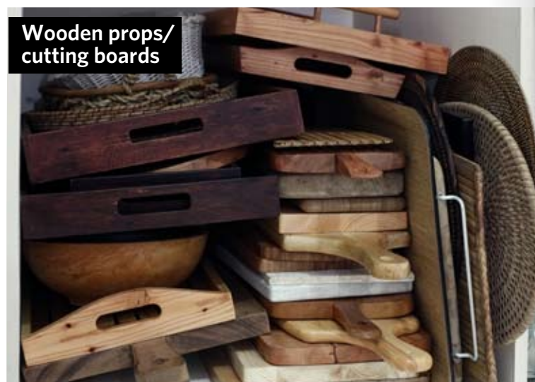
Wooden props/ cutting boards