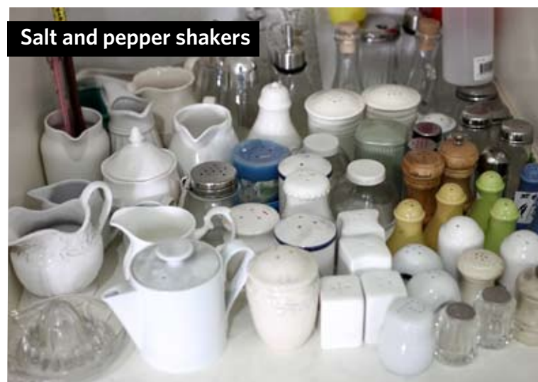
Salt and pepper shakers