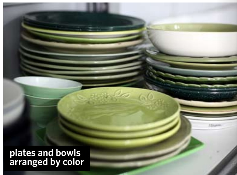
plates and bowls arranged by color