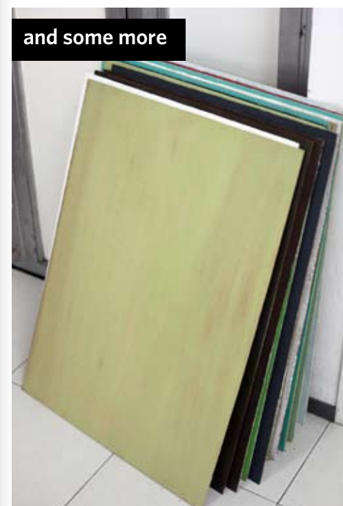
and some more