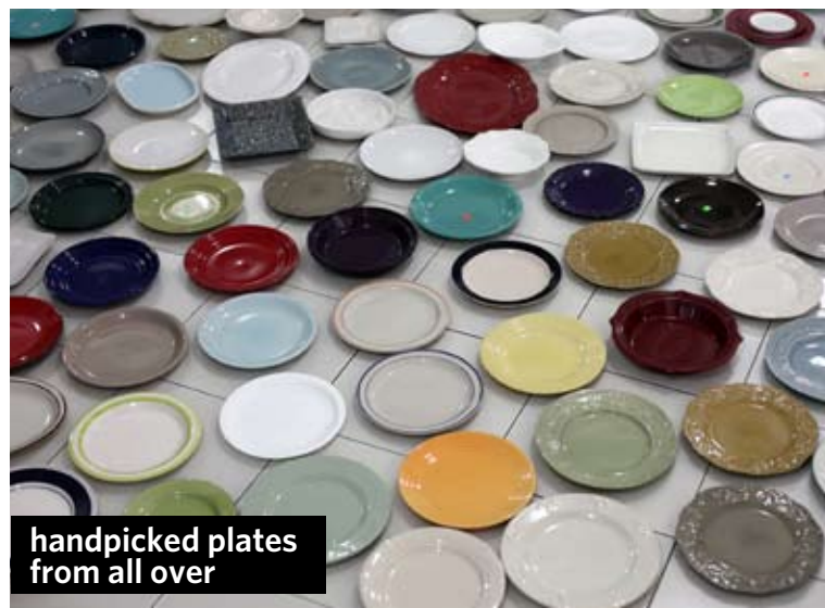
handpicked plates from all over