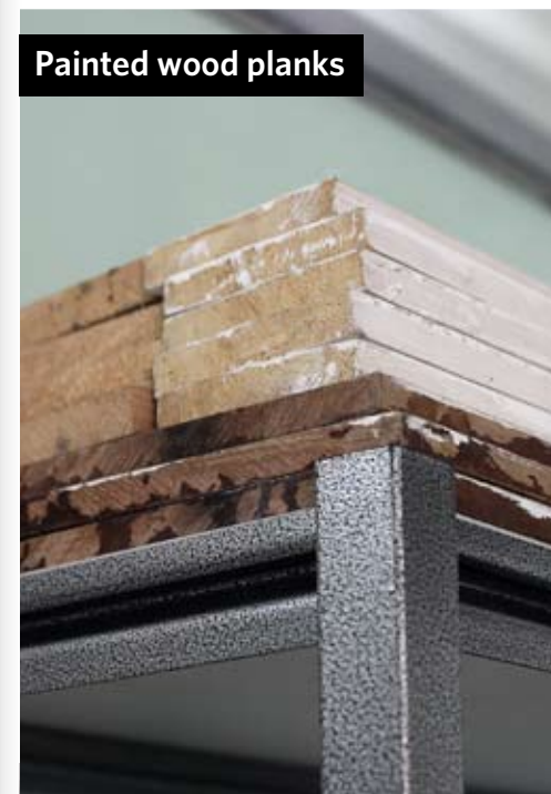
Painted wood planks