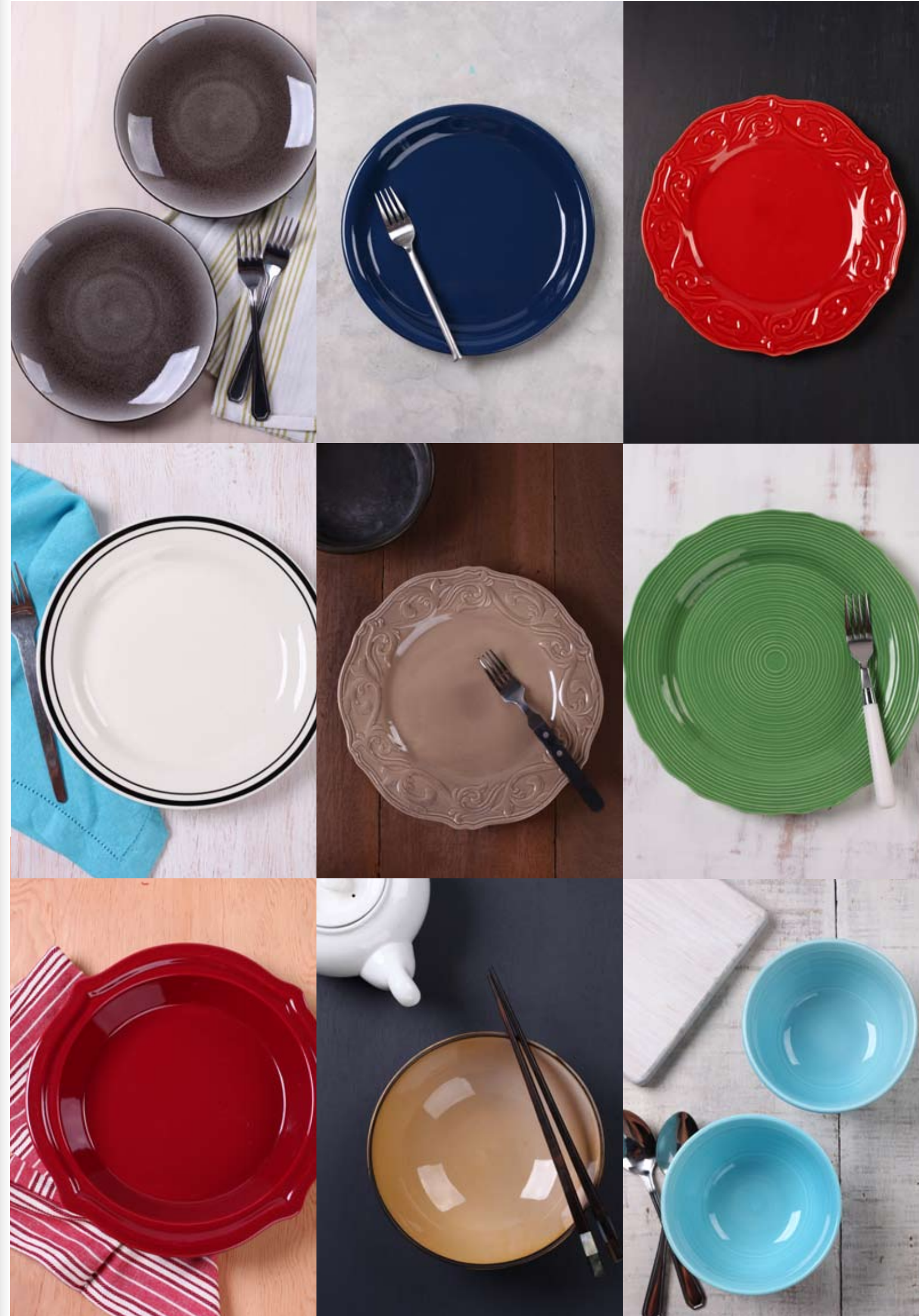
Table is Set

We pride our studio as being dedicated to food photography foremost. That's why we continuously beef up our props and backgrounds while keeping up with current trends in food/prop styling. From marble to concrete, to distressed painted panels, to linens, we've got different table and wall backgrounds to set the look and feel of each layout. Plates, bowls, glasses, cups, saucers, flatware, chopping boards, salt and pepper shakers etc. - we've got them in different colors and shapes to complement and enhance any dish. We've got the table set. You just bring the food.