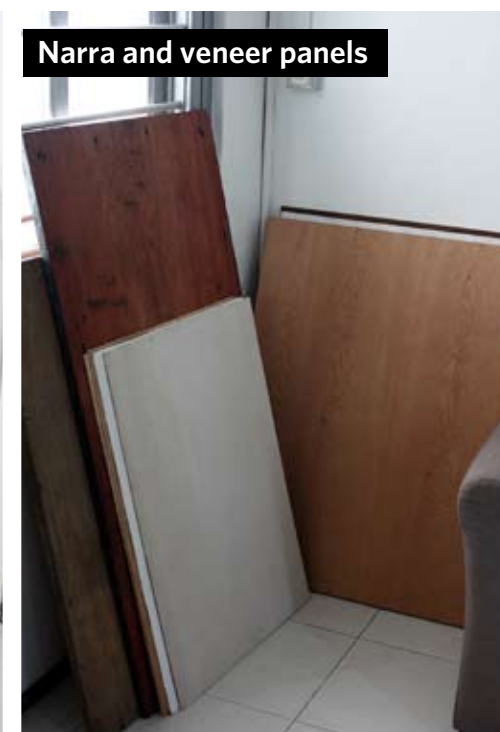
Narra and veneer panels